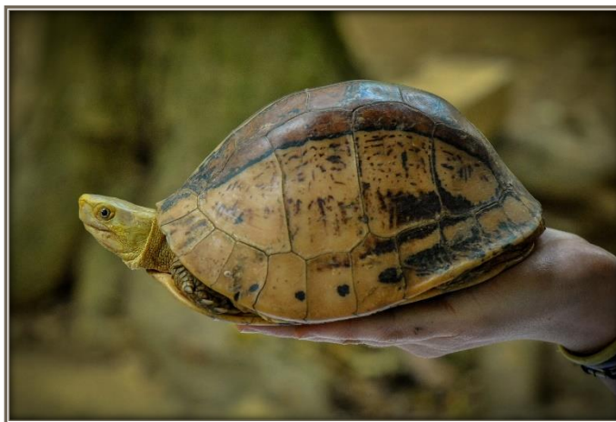
SOUTHERN VIETNAMESE BOX TURTLE ( CUORA PICTURATA)

In 2010 the TCC opened a section of the turtle centre to the park's 80,000 annual visitors as part of an initiative to enhance potential opportunities to raise public awareness. The visitor interpretation centre (VIC) includes underwater viewing tanks, an incubation viewing room, outdoor enclosures, and large ponds where turtles can be seen in near wild settings. Throughout the VIC interpretive panels, photographs and signboards have been created to educate visitors, students, rangers, and officials about the diverse and endangered turtle fauna of Vietnam. It has become a priority at the TCC to increase public awareness on the values of protecting wildlife, as this is a fundamental first step to protect tortoises and freshwater turtles in Vietnam. For this reason, the TCC also places special importance on training students and young professionals, preferably Vietnamese, to encourage the next generation of young turtle scientists and conservationists.