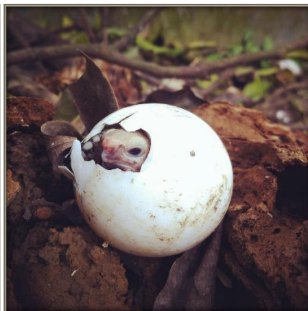
ELONGATED TORTOISE (INDOTESTUDO ELONGATA ) HATCHING