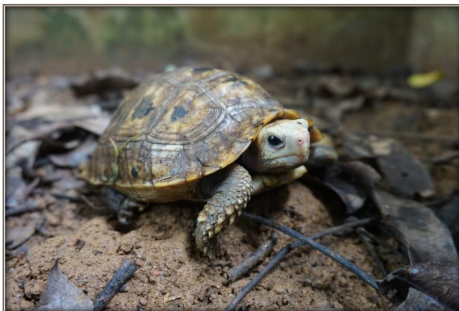
ELONGATED TORTOISE (INDOTESTUDO ELONGATA)

Although the majority of Vietnamese tortoise and freshwater turtle (TFT) species are under threat, there is a shortage of funding and it has been essential to identify priorities for conservation breeding activities. At the TCC, captive breeding programs are prioritized for the most vulnerable native TFT species of Vietnam, recognized by the IUCN Red List of Threatened Species. To date, the TCC has succeeded in breeding 15 species at the centre.