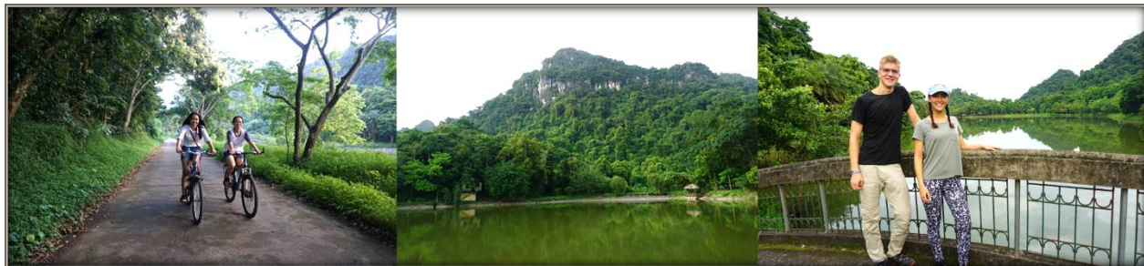
ACTIVITIES IN CUC PHUONG