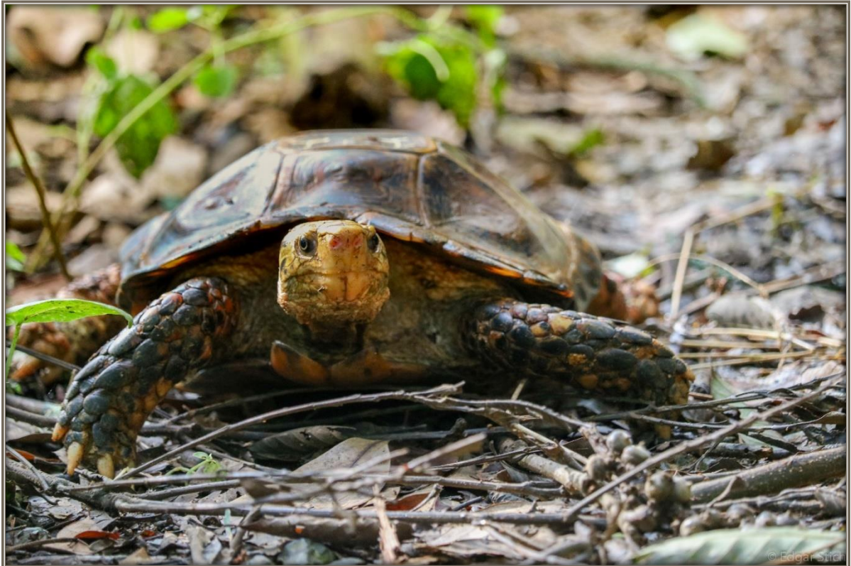
IMPRESSED TORTOISE ( MANOURIA IMPRESSA )

Volunteers also can buy some items at shops in the village such as shampoo, soap, towels, toothpaste.