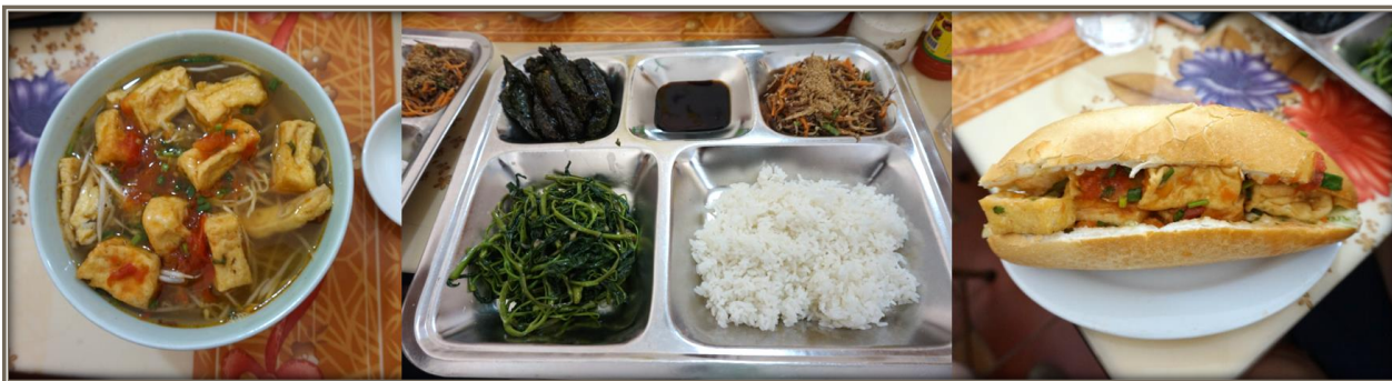
TYPICAL FOODS AT A LOCAL RESTAURANT

Your volunteer fees cover three meals a day every day during your stay. There are shops in the village that sell some fresh fruits, tea, coffee, milk, biscuits, baguettes, toiletries and other 'essentials'. In addition, there is a market early in the morning (from 6am to 9am), which is easy to reach by bicycle that sells fresh foods, fruits, vegetables and meat. If volunteers have specific foods they would like, they should bring them from their own country or buy them in Hanoi. Things like jam, butter, cereals and cheese can all be bought in Hanoi. Vegetarians/Vegans are easily catered for.