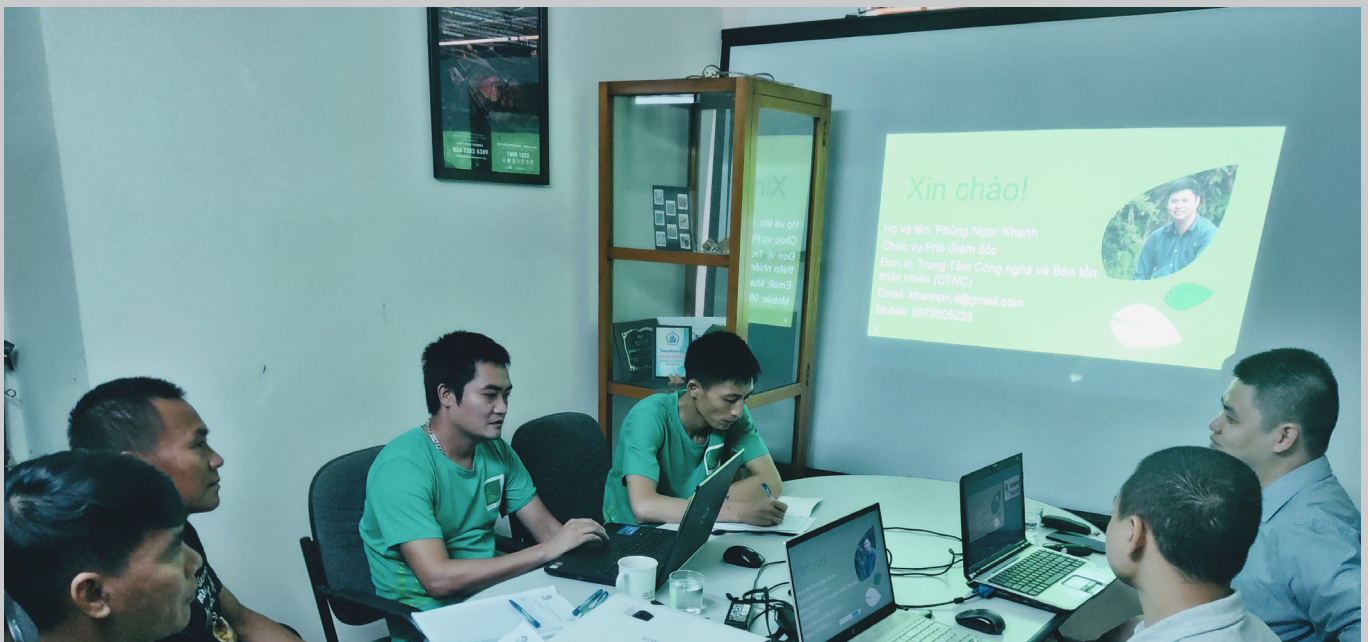
SMART training was hosted at the ATP office, 30 th October 2021.