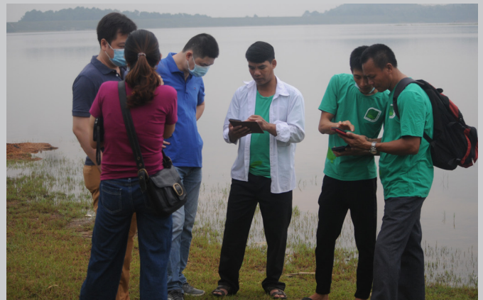
Rafetus project staffs practising using SMART software at Dong Mo lake.