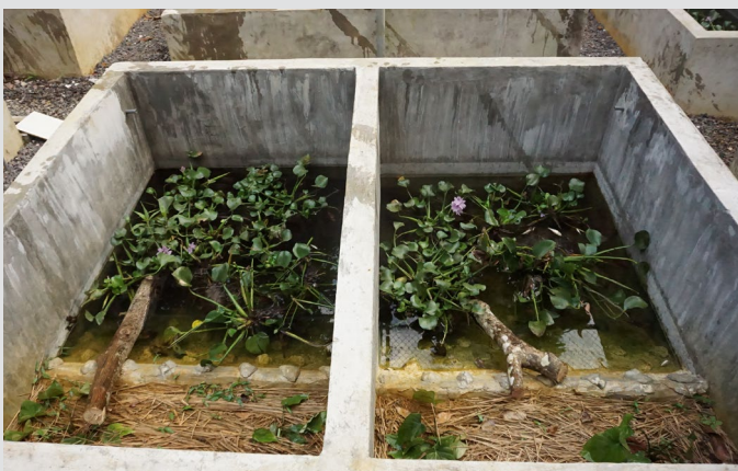
Rescued Big-headed Turtles have been moved to their new enclosure.