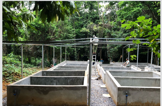
The outer cage for the enclosures will protect this precious population from poachers.