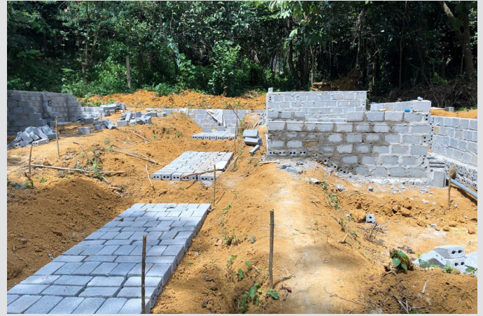
The work begins on the new enclosures.