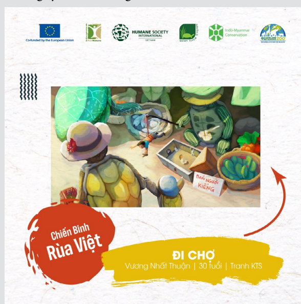
Vương Nhất Thuận (code 000171) won the Vietnamese Turtle Warrior award with the painting “Đi chợ” (go to market). © Vương Nhất Thuận and PanNature