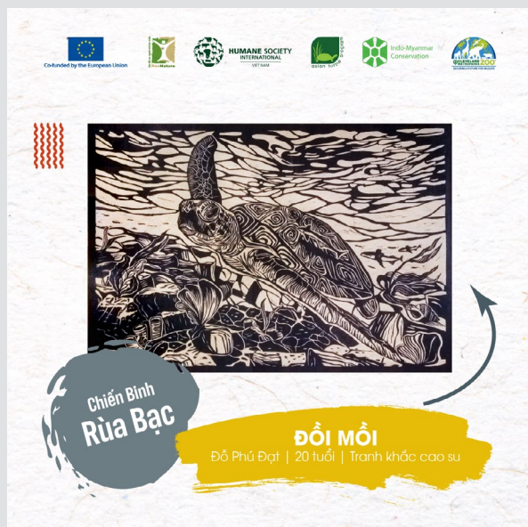
Đỗ Phú Đạt (code 000006) won the Silver Turtle Warrior award with the painting “Đôi Mồi” (Hawksbill Sea Turtle). © Đỗ Phú Đạt and PanNature