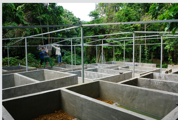
A new Big-headed Turtle enclosure is nearing completion and will be ready in September 2021 after the drain system and waste water tank are built.