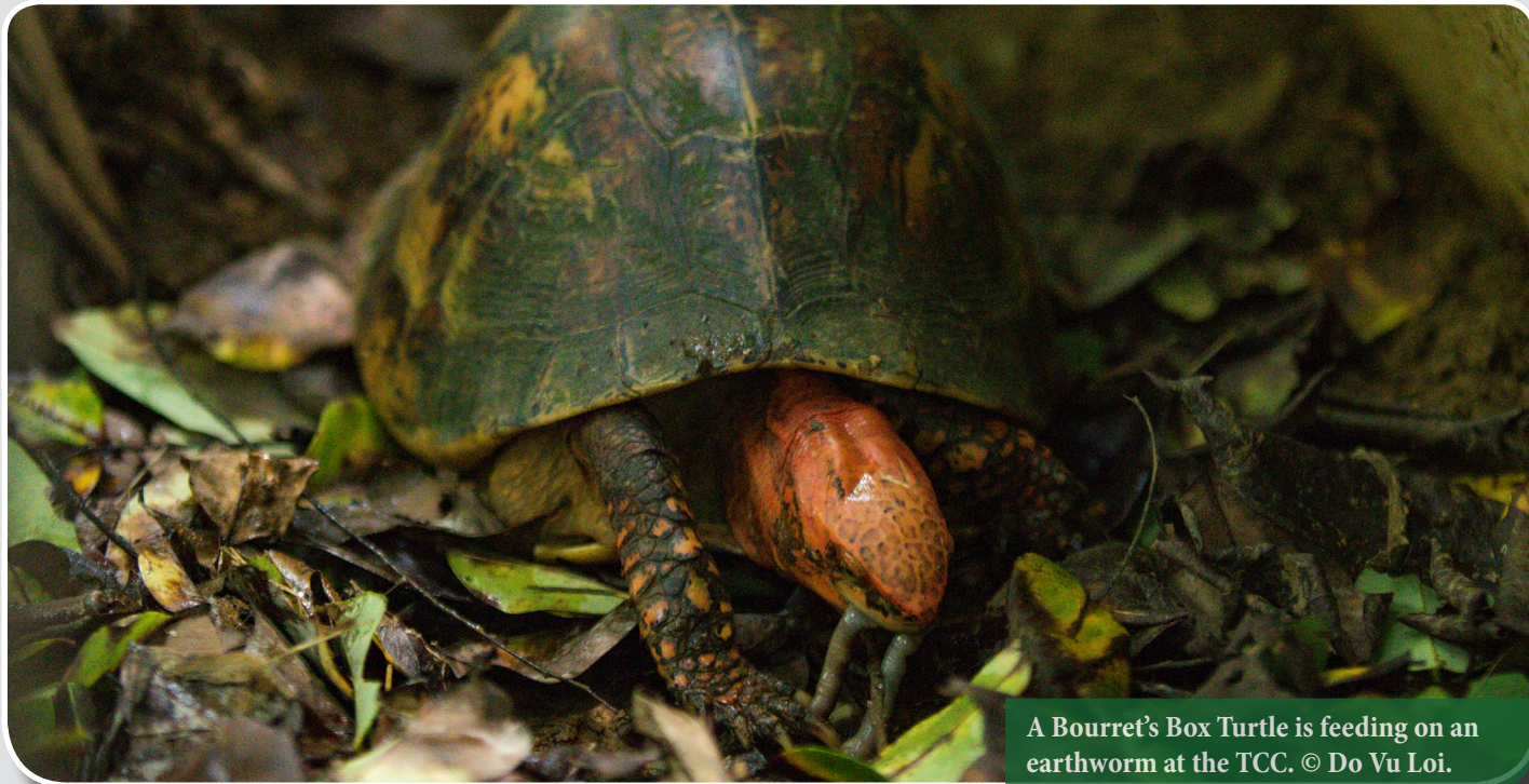
A Bourret's Box Turtle is feeding on an earthworm at the TCC.

For more current news and updates on tortoise and freshwater turtle conservation in Asia, visit our website: www.asianturtleprogram.org