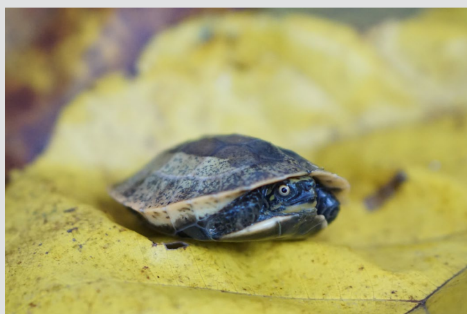
Indochinese Box Turtle ( C. galbinifrons ) hatchling at the TCC.

Despite the impact of COVID-19, the TCC team is still working hard and is dedicated to the conservation of turtles of Vietnam. We still require support for improved enclosures for many endangered species and for intensive rescue and care efforts to help them get back to the wild. Please join us to save Vietnam's turtles and tortoises and head over to our website to make a donation: https://asianturtleprogram.org/donate/ . Thank you!