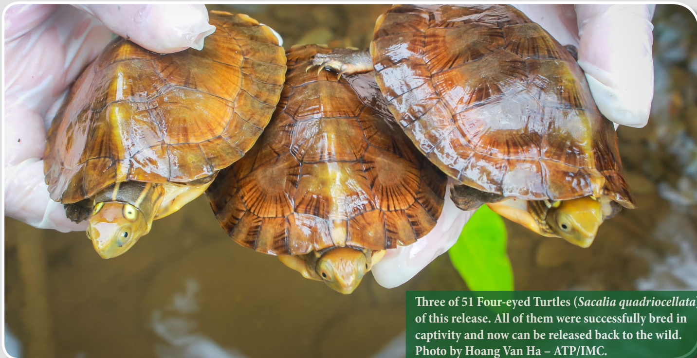
Three of 51 Four-eyed Turtles ( Sacalia quadriocellata ) of this release. All of them were successfully bred in captivity and now can be released back to the wild.

For more current news and updates on tortoise and freshwater turtle conservation in Asia, visit our website: www.asianturtleprogram.org