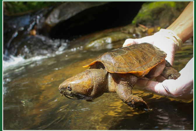
Big-headed Turtle ( Platysternon megacephalum ) are endangered but releases like this one will help support and boost wild populations.

Facebook: www.facebook.com/AsianTurtleProgram