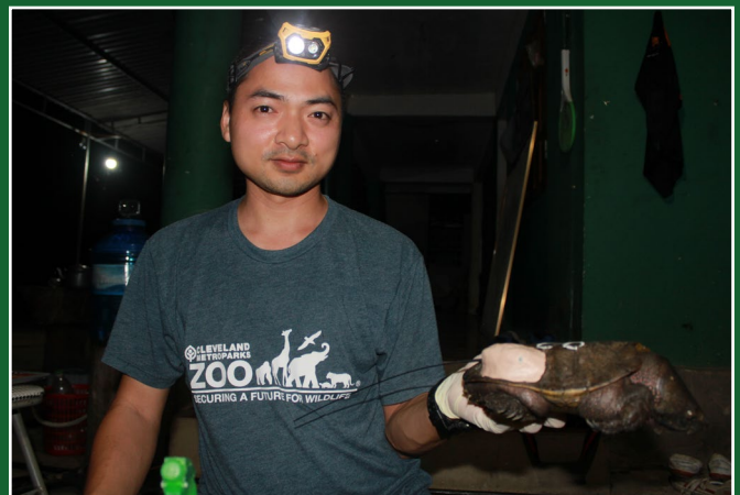
The Big-headed turtles were fitted with radio transmitters so that we can monitor their movement and behaviour following release.