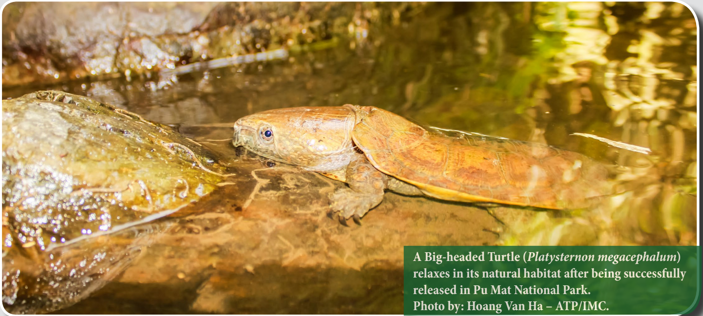
A Big-headed Turtle ( Platysternon megacephalum ) relaxes in its natural habitat after being successfully released in Pu Mat National Park.

For more current news and updates on tortoise and freshwater turtle conservation in Asia, visit our website: www.asianturtleprogram.org