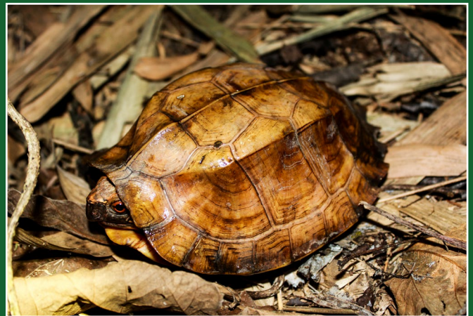
Two Keeled Box Turtles ( Cuora mouhotii ) also returned to the wild during this release.