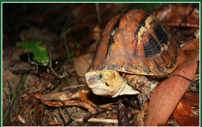
A happy return to the wild for this Bourret's Box Turtle ( Cuora bourreti ) on a rainy day.