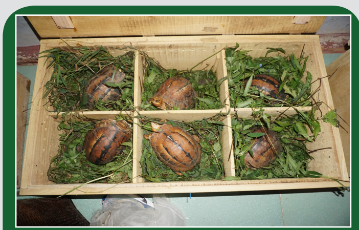
The turtles were transported in wooden transportation boxes during their long trip from Cuc Phuong to central Vietnam.

We would like to thank Quang Nam Forest Protection Department for conducting the confiscation last year, as well as the Cleveland Metroparks Zoo, Zoological Society of London (ZSL), and Thanh Truong Loc Construction Co., Ltd for their support