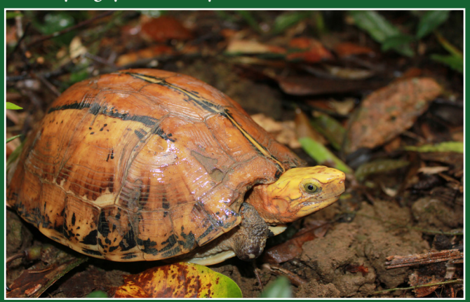
This tough turtle might have survived hunting dog bites, snare traps and other dangers (evidenced by its healed injuries) before its arrival at the Turtle Conservation Centre last year.