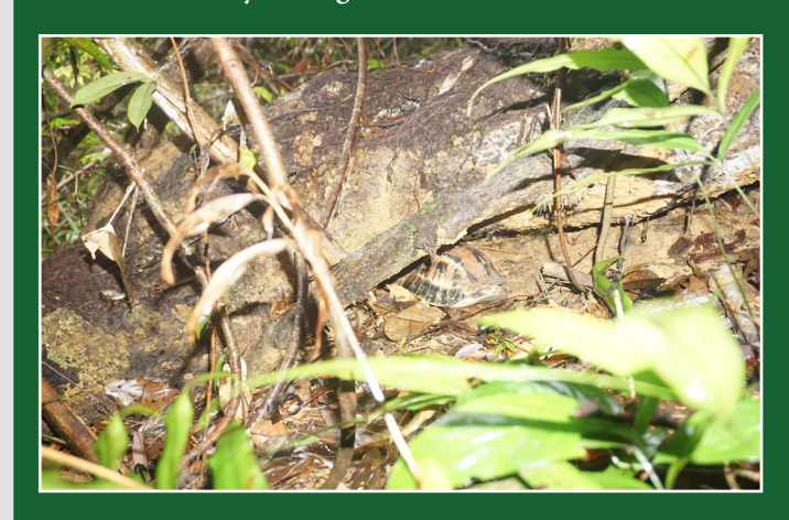
One turtle may have already found her/his new shelter for this winter!