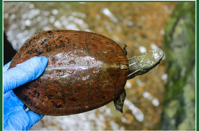
One of three endangered Four-eyed Turtles of this field survey.