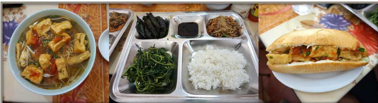
TYPICAL FOODS AT A LOCAL RESTAURANT

Your volunteer fees cover three meals a day every day during your stay. There are shops in the village that sell some fresh fruits, tea, coffee, milk, biscuits, baguettes, toiletries and other 'essentials'. In addition, there is a market early in the morning (from 6am to 9am), which is easy to reach by bicycle that sells fresh foods, fruits, vegetables and meat. If volunteers have specific foods they would like, they should bring them from their own country or buy them in Hanoi. Things like jam, butter, cereals and cheese can all be bought in Hanoi. Vegetarians/Vegans are easily catered for.