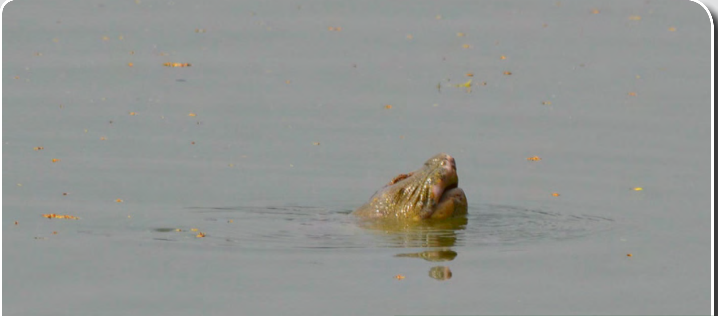
A photograph of the Hoan Kiem Turtle from July 2015

For more current news and updates on tortoise and freshwater turtle conservation in Asia, visit our website: www.asianturtleprogram.org