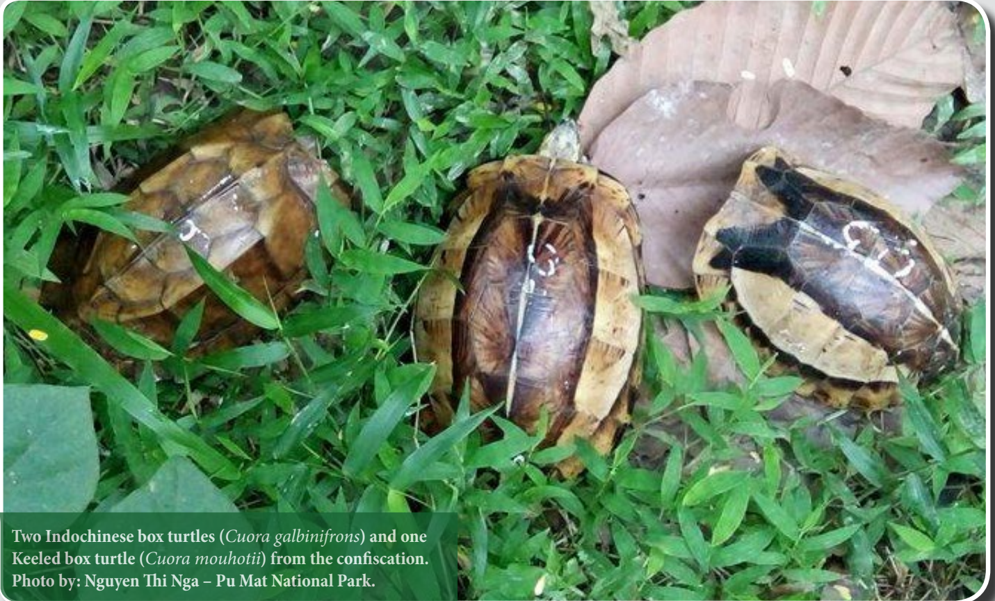
Two Indochinese box turtles ( Cuora galbinifrons ) and one Keeled box turtle ( Cuora mouhotii ) from the confiscation.

For more current news and updates on tortoise and freshwater turtle conservation in Asia, visit our website: www.asianturtleprogram.org