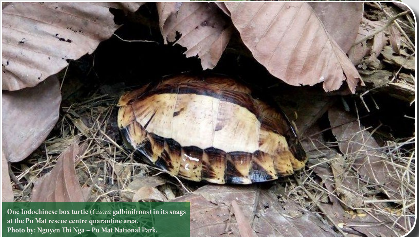
One Indochinese box turtle ( Cuora galbinifrons ) in its snags at the Pu Mat rescue centre quarantine area.