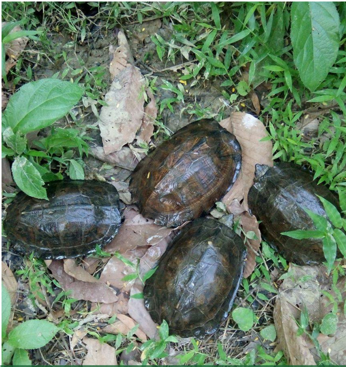
Four Oldham's leaf turtle ( Cyclemys oldhamii ) from the confiscation.

For further information please contact: Asian Turtle Program - Indo-Myanmar Conservation Room 1806, C14 Bac Ha Building, To Huu road, Nam Tu Liem Dist., Hanoi, Vietnam PO Box 46 Tel: +84 (0) 4 7302 8389 Email: info@asianturtleprogram.org Website: www.asianturtleprogram.org Facebook: www.facebook.com/AsianTurtleProgram